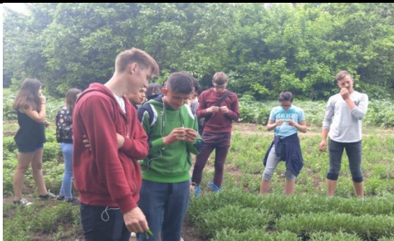
Fig. 3 – "Medicinal plants"

The activity "Protected areas" took place at the "Ion Creangă" Branch of the County Library "Gh. Asachi" Iasi.