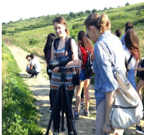
Fig. 6 "A visit to the Iași Delta"