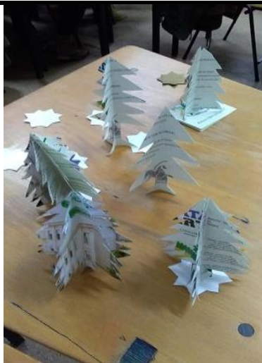
Fig. 7 "Recycling"